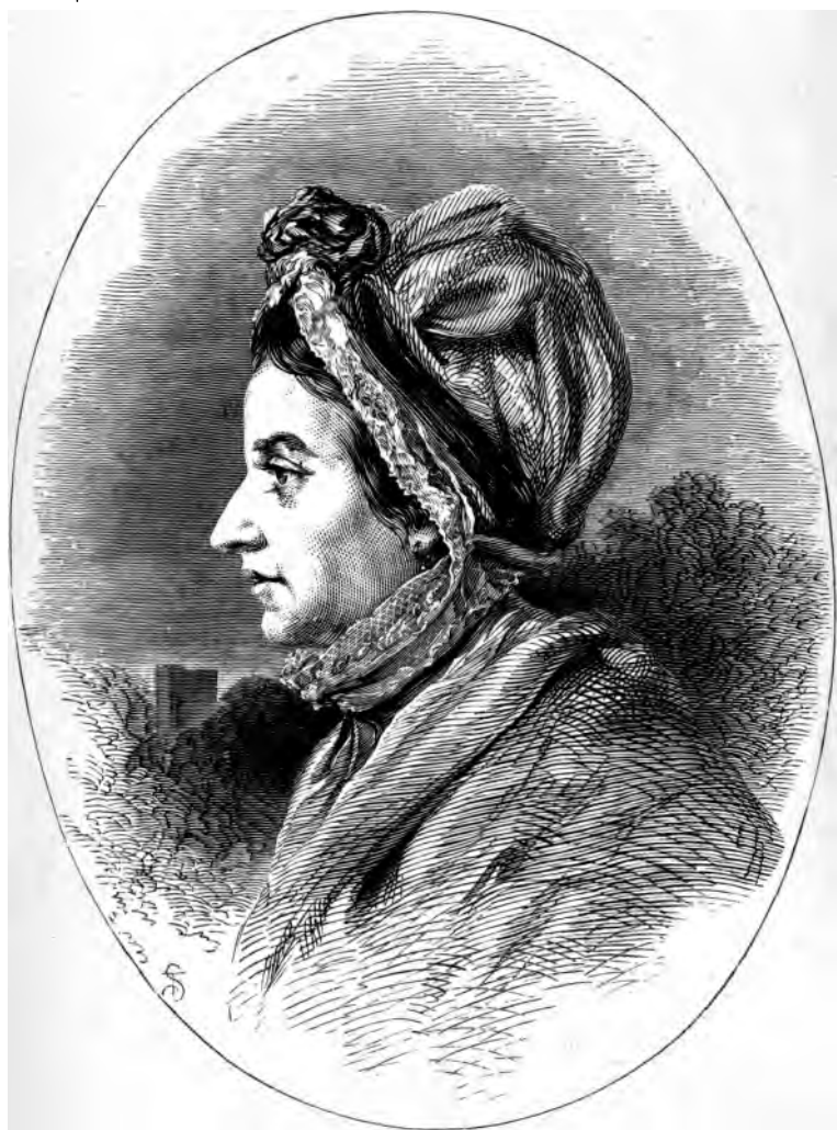
MRS. SUSANNA WESLEY.